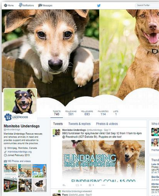
Twitter Followers: 693

In 2014 we began utilizing our Twitter and Instagram accounts to reach more followers and supporters. Instagram has proven to be a great success in gaining more exposure for the rescue, and Twitter has been an excellent way at keeping in touch with our media contacts that time and time again, support our rescue by featuring many of our stories.